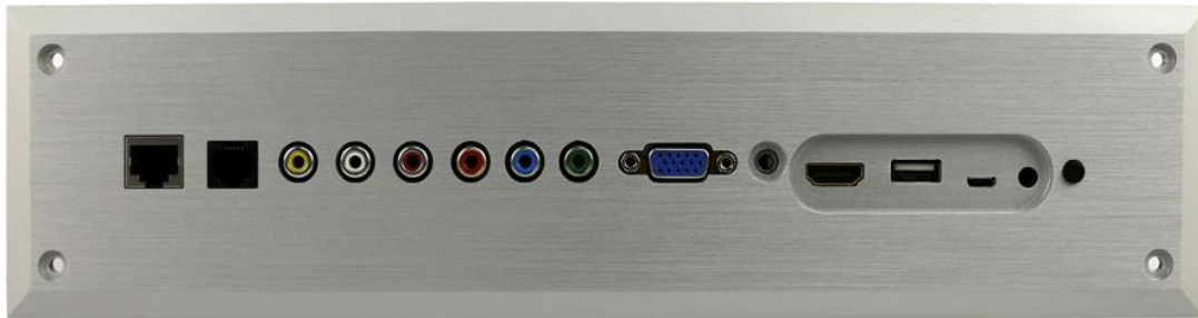
▲ HD-521P-A Front: Aluminum panel, can be locked on the table

Our product offers solutions for noise, security concerns, and transfer distance. Apply to places such as data center control room, conference room, school and corporate training environments.