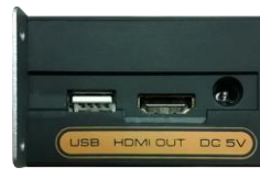
▲ Side (right)-USB2.0 and HDMI output