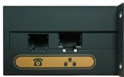
▲ Side(left)-RJ-11 and RJ-45 connector