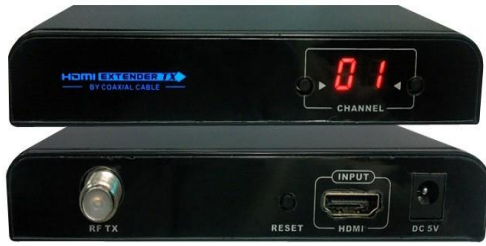
▲ VE-30RFM TX Transmitter (Front / Rear)