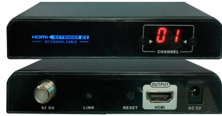
▲ VE-30RFM RX Receiver (Front / Rear)

VE-30RFM HDMI to RF Matrix Extender is designed to convert HDMI signal to HD digital TV signal based on DVB-T CATV signal, it uses 64QAM mode to realize the HD digital TV signal conversion and transmit via coaxial cables for long distance.