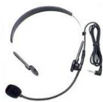
Head Set/ Ear-hook microphone