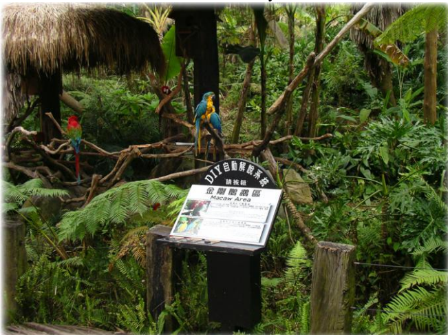
▼ Green World Ecological Farm - Gold Macaw Area DIY Audio Kiosk Systems