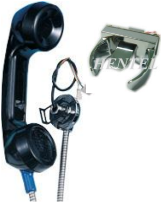
▼ Telephone (Option)