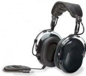
▼ Telephone Headset (Option)