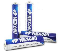
▲ Recharge battery

Meicheng® MEI CHENG AUDIO VIDEO CO., LTD.