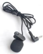
▲ Clip microphone (Directional)