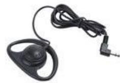
▲ Single-sided headphone