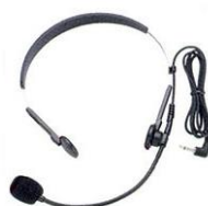
▲ Ear-hook microphone